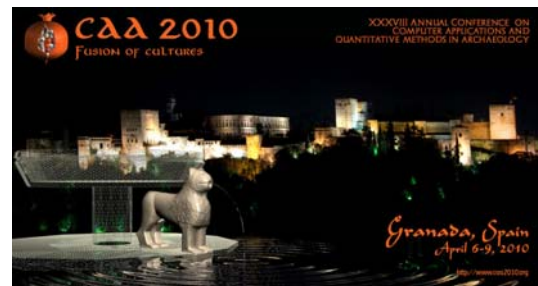
Figure 2: Here is a sample figure

Example 2: Capturing a screenshot of your entire 1024×768 pixel display monitor may be useful in illustrating a concept from your research. In order to be reproduced faithfully, that 1024×768 image should be no larger than 85 mm by 64 mm (approximately) when placed in your document.